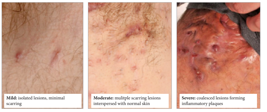
Figure 3. Features of classical Hurley's staging system for HS

in any wound in which the diagnosis is unclear or malignancy is a concern.